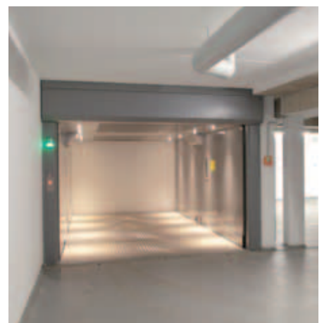
Rolling gate and traffic lights in a discreet appearance in the lower position.